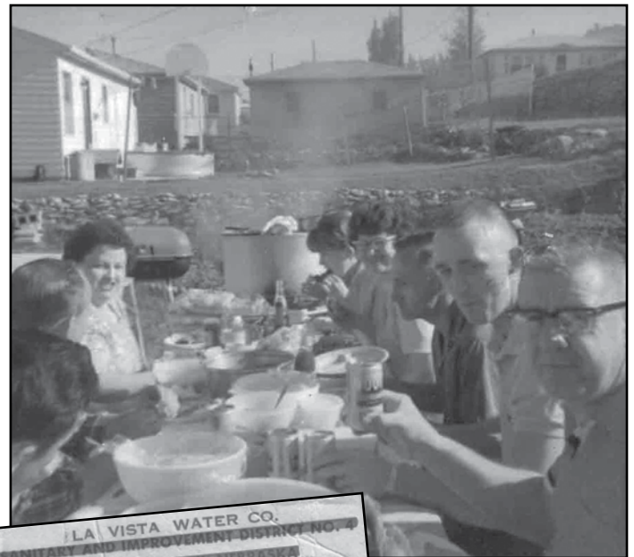
ABOVE: A neighborhood picnic from the 1960's.

Beginning February 23rd, the city's Web site, www.cityoflavista.org , will feature the new schedule of events as well as an online store of memorabilia available for purchase.