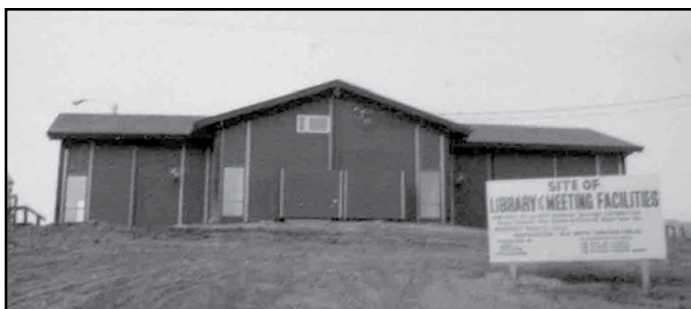
Turn to page 7 for more on the Library's history