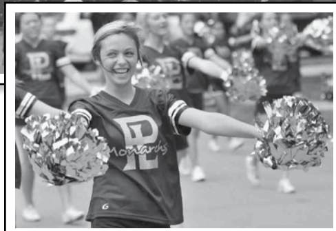
Cub Scout Pack 61 won the award for best float in the La Vista Daze parade.