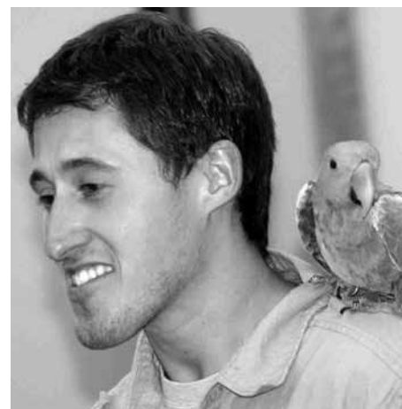
The Library's summer reading program featured many special presentations, including this one from Wildlife Adventures