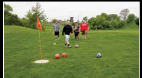
FootGolf at La Vista Falls