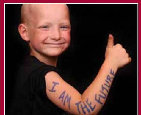
Taste of La Vista