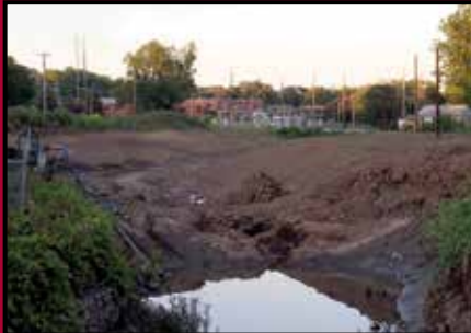
Thompson Creek Restoration