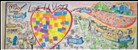
Look Out La Vista