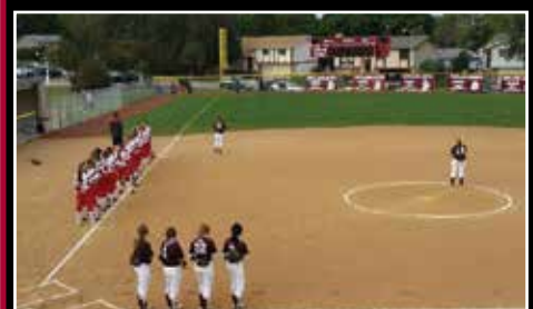
City Park Ballfield Improvements