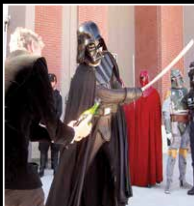
Alamo Drafthouse Opens for Business