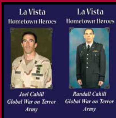
Hometown Heroes Banner Program