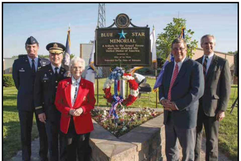
Last year's Hometown Heroes Event included the unveiling and dedication of the City's new Blue Star Memorial at City Hall.