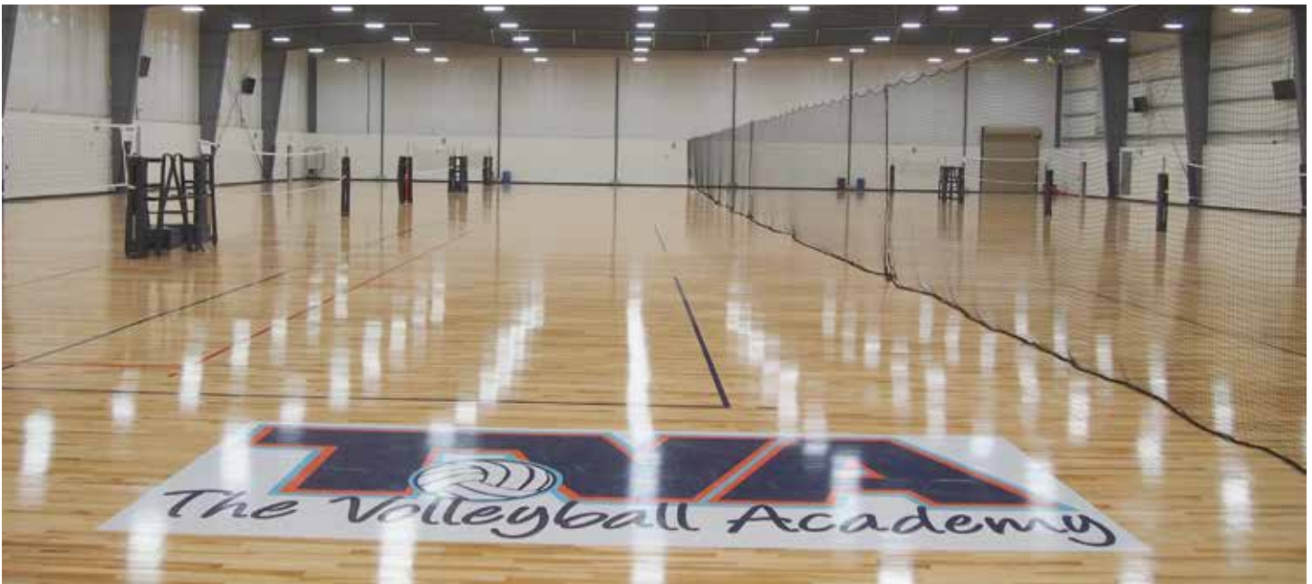
Pictured is The Volleyball Academy, a recently completed more than 50,000-square-foot volleyball facility. This facility is now open for business at 11934 Portal Road.