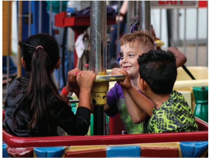
Central Park was filled all weekend with people who took in the carnival and vendors.

The Salute to Summer Festival would not be possible without the generous contributions of the La Vista Community Foundation, Bellino Fireworks and La Vista Keno.