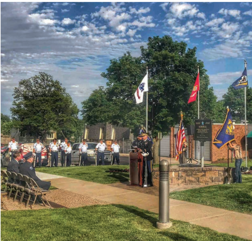
The third annual Hometown Heroes Event was held on Thursday evening at City Hall, dignitaries, veterans and families attended this event, which was designed to honor those who have served our nation in the military and those who have given the ultimate sacrifice for our freedom.