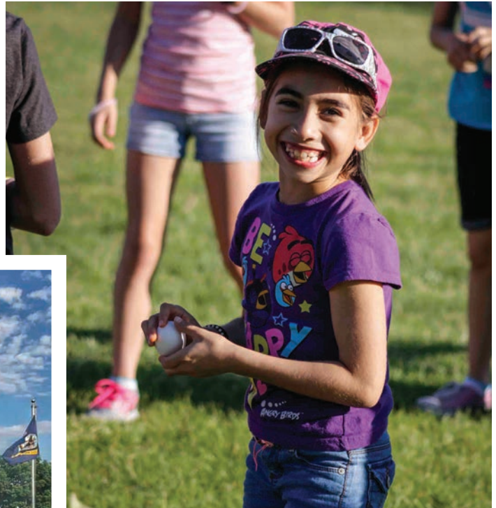
Thousands of people enjoyed the Community Cookout on Friday evening, sponsored by the La Vista Community Foundation, and the fireworks display, provided by Bellino Fireworks.