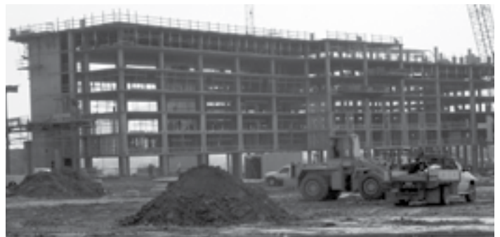
Construction is progressing on the Embassy Suites.

Development in the Southport area is booming and is a direct result of La Vista's planning and forethought regarding economic development. Public-private partnerships are becoming increasingly more common as cities across the country compete to bring retail stores and tourist attractions to their locations. The vision and leadership of La Vista's Mayor and City Council has ensured that this community will not only survive, but will thrive long into the future.