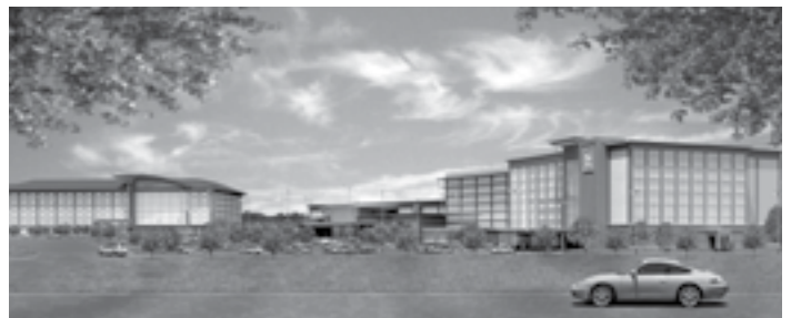
Artist Rendering of the Embassy Suites, Conference Center and Marriott Courtyard Complex.

Three years and a great deal of negotiating later, the official application to the Economic Development Program for funding assistance on the hotel/conference center project was received. It was approved by the La Vista City Council in February 2007. The application calls for the City of La Vista's EDP to provide a $3 million grant for land for the conference center and parking and an $18 million loan to finance and pay part of the actual cost (estimated at $23-$24 M) for designing, developing, constructing, equipping, furnishing and acquiring the conference center and