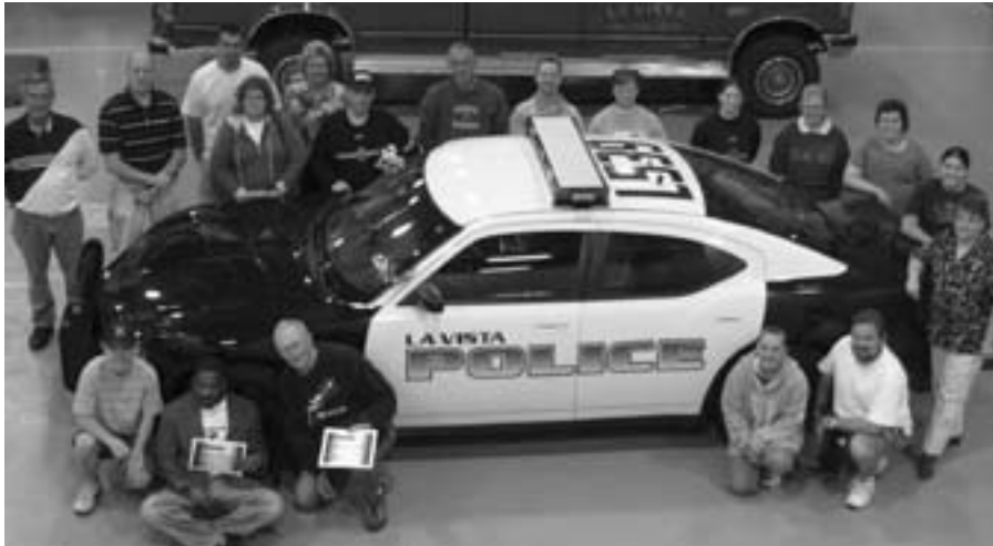
The Spring 2007 Citizen's Police Academy Class