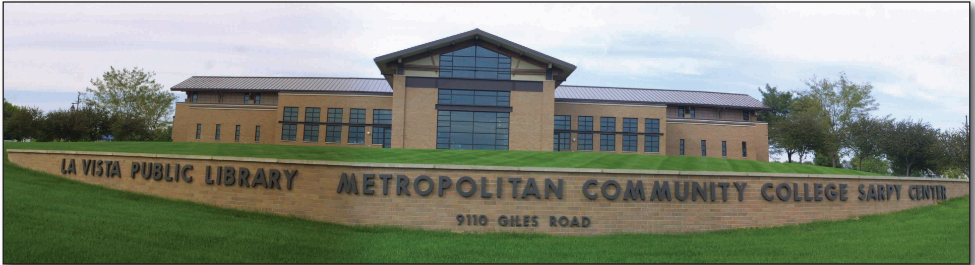
A PANORAMIC PHOTO OF THE EXTERIOR OF THE LA VISTA PUBLIC LIBRARY AND METROPOLITAN COMMUNITY COLLEGE SARPY CENTER.