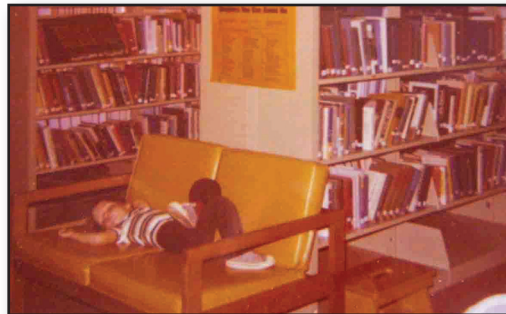
FOR SOME, THE LIBRARY HAS BEEN A PLACE TO RELAX, INCLUDING THE LITTLE BOY IN THIS UNDATED PHOTO.

A few months passed and in the fall of 1972 the council approved a proposal to contribute $75,000 for the construction of a library next to City Hall. Mayor Leathers promptly vetoed the measure, but, true to their word