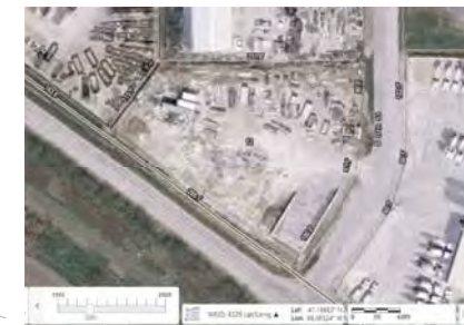
2001 AERIAL IMAGE SCALE: NONE