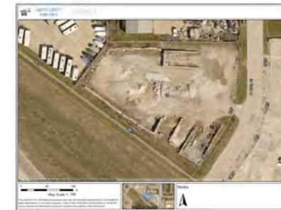
2020 AERIAL IMAGE SCALE: NONE