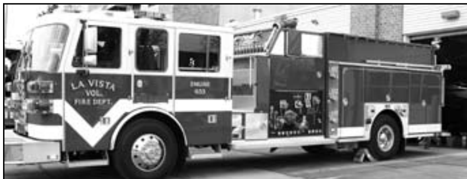
The Fire Department recently added two pieces of apparatus to its fleet, an engine and an aerial truck. Inspections and training have been completed and both trucks are currently in service. The trucks were built by the Sutphen Corp.