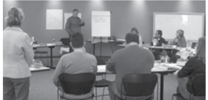
The Mayor and City Council participate in an annual Strategic Planning meeting to set goals and direction for the upcoming year. Major issues such as the erosion along Thompson Creek (see below) were discussed.

The City sincerely appreciates the residents who took the time to respond. A full report of the citizen survey results is available for review at La Vista City Hall, the La Vista Public Library and on the City's website at www.cityoflavista.org .