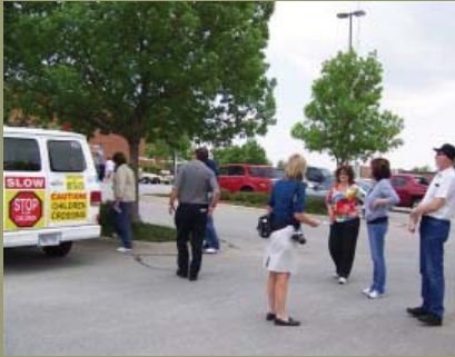
Ice cream stop at walking tour

The design team will begin preparing alternatives for the project in the coming weeks. On August 17, the City and design team will host a second community workshop, where these alternatives will be presented for review, discussion and comment. Please plan to attend this very important meeting and provide your comments on the alternatives.