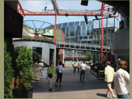
Power and Light District

For further information regarding the project visit the City website: www.cityoflavista.org/vision 84.